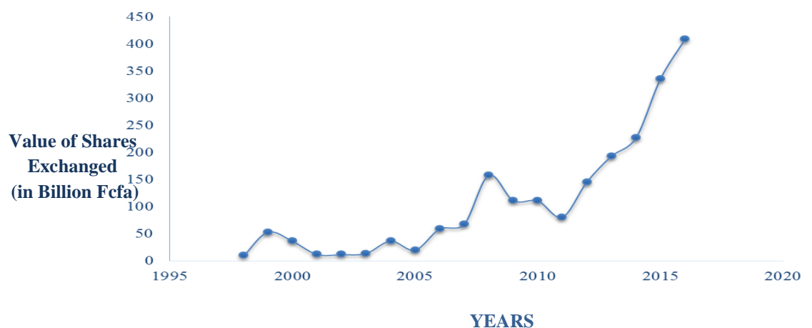
Figure 3: Evolution of the liquidity of the BRVM