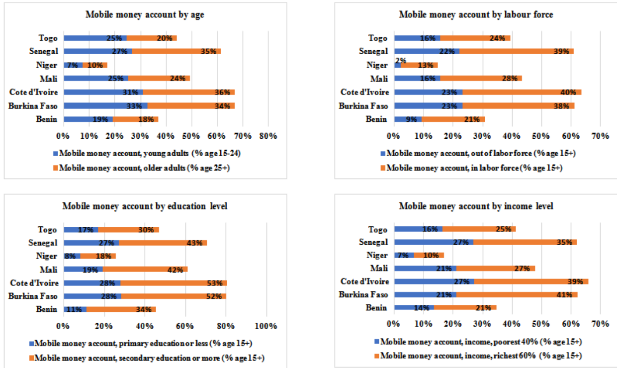
Figure 2. Mobile money account by individual characteristics

Source: Author's analysis using Global Financial Index Database, 2017.